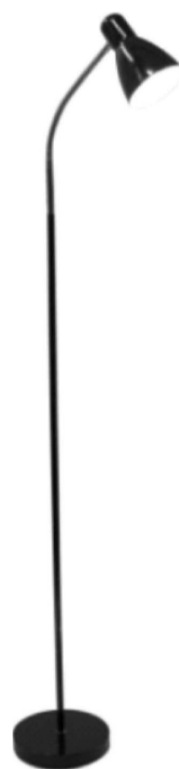
Instruction Manual MODEL: KL-6315F